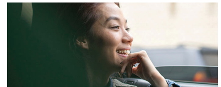
Staples is revolutionizing customer service with their Easy Button

"It's time to harness the power of cognitive computing. In this digital era, organizations are not only competing with other organizations in their market, they're also competing against innovation.