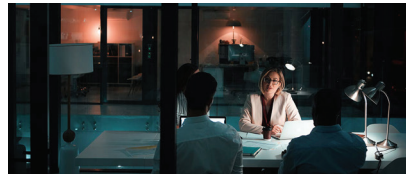
Insurance employees are working with Watson to assess claims 25% faster